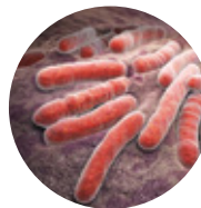
Mycobacterium bovis (TB)